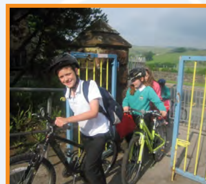
Tebay Community Primary's playground was full of bikes during bike week. The staff saw the arrival of a butterfly and even Minnie Mouse!