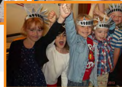
Pupils at Grange CE School having a great time