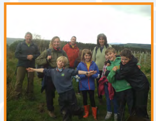
Children and staff from Lowther Endowed School