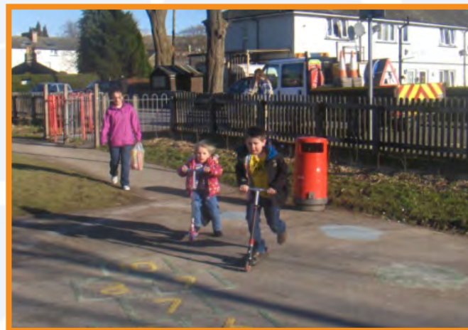
Children scooting to school at St Oswald's Burneside