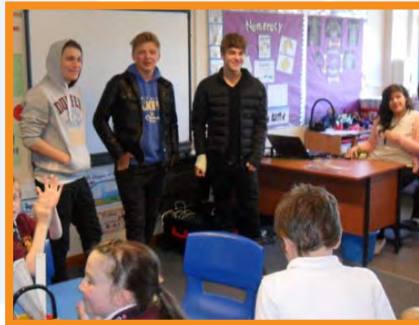
Classroom Q&A and photo sessions