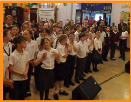
Victoria Junior School Choir