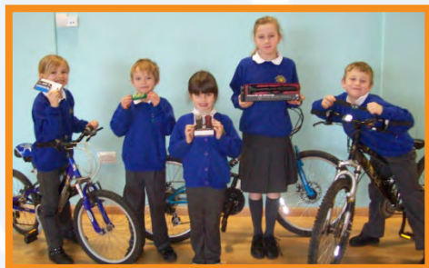
Winners from Vickerstown School

This year's Big Pedal saw a three fold increase in Cumbrian schools taking part. These schools have reduced their carbon footprint and stayed healthy as part of a three-week challenge that saw almost 10,000 journeys to school made by scooting or cycling. The 10,000 Cumbrian journeys contributed to around 847,000 journeys travelled nationwide. Active Travel awarded schools with a cycle bundle so that they were able to award prizes to those children who made a special effort to cycle or scoot to school.