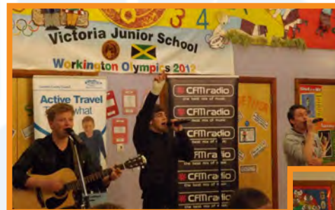
District 3 in Action