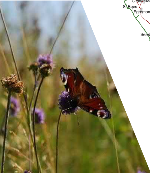
Peacock butterfly on devil's-bit scabious