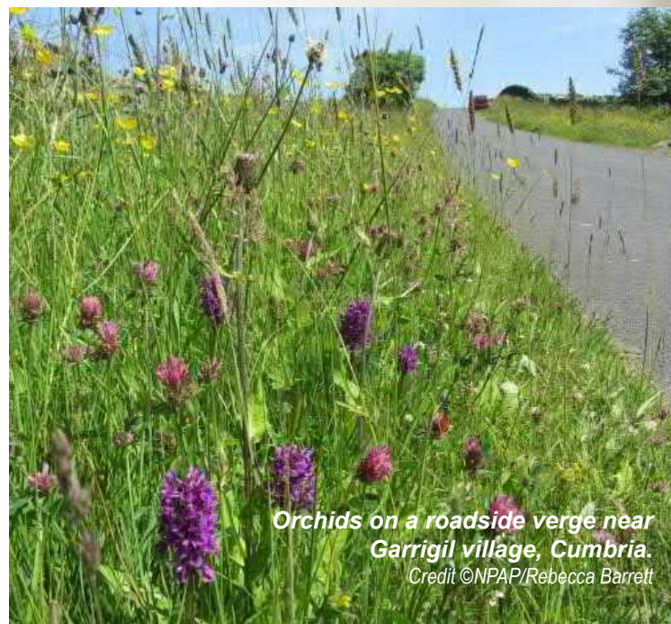
Orchids on a roadside verge near Garrigil village, Cumbria.

Cumbria Wildlife Trust Plumgarths, Crook Road, Kendal Cumbria LA8 8LX T: 01539 816300 www.cumbriawildlifetrust.org.uk