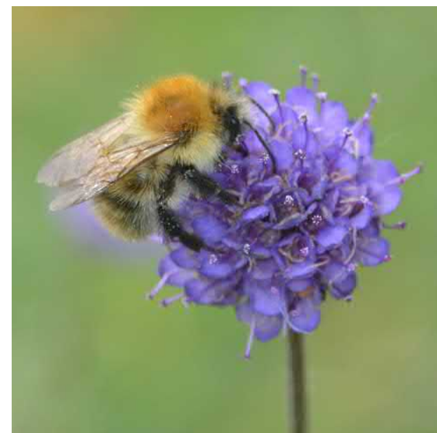
Common carder bumblebee