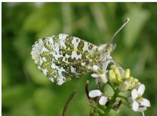
Orange tip butterfly image Ryan Clark

Early cuts may look tidy, but provide poor habitat for wildlife.