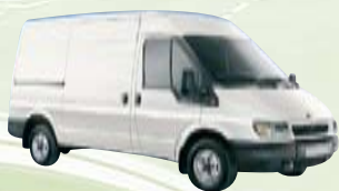
Van of any size

If you want to bring household rubbish to any of Cumbria's HWRCs in a: