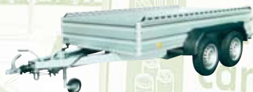
Twin axle trailer