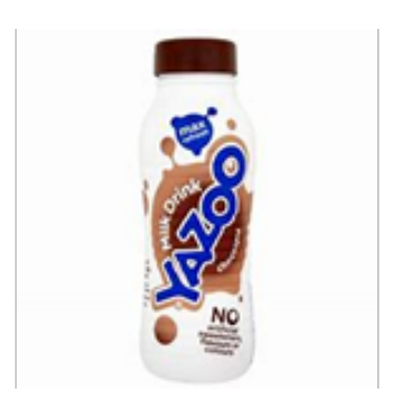
9.5 cubes (38.4g in 400ml)