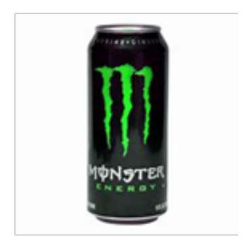
13.8 cubes (55g in 500ml)