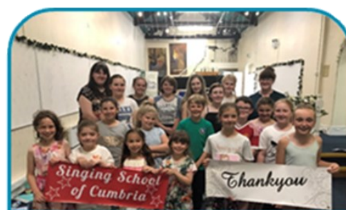
Singing School of Cumbria were funded £1,500 in 2017.