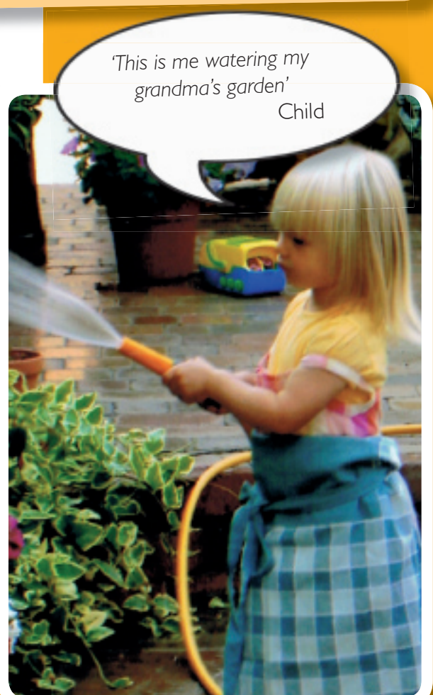
An example of a photograph from one of the booklets.

The timescale was approximately 6 weeks from start to finish; this was a huge task initially as we needed to target all the children who were attending nursery at that time. We have a system now in which the introductory letter and 'All about me' booklet is sent out to the parents when they register their child at the nursery.