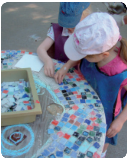
Mosaic patterns for an outside table (cable drum)