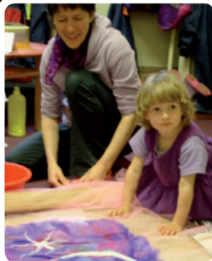
Parents felting skills helped with this creation

If appropriate we produced a display so all parents could see the exciting events of the week or they have linked with other projects, for example the textile project 'Wool is my Bread' or displays for the County Show.