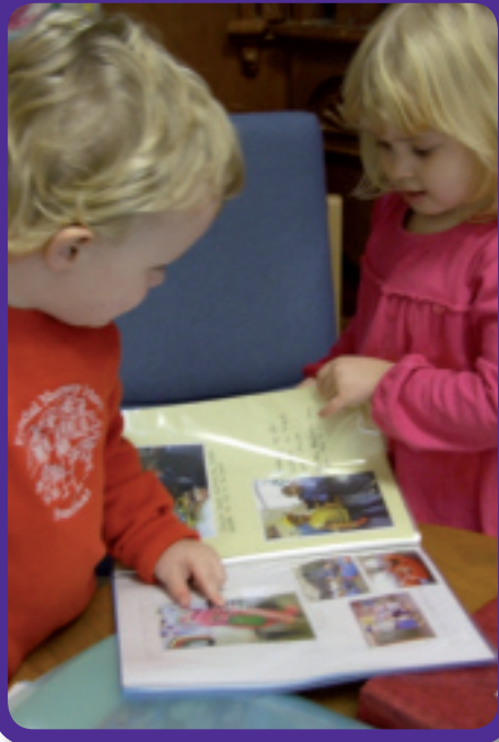
Sharing a special book