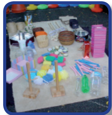
Setting up outdoors

The parents started to watch their children playing at home with objects not conventional toys, and they started understanding the importance of discovery and exploration at this stage of the babies' development. The meetings on schemas and observations progressed very well, and our first session with the babies took place. This was an amazing session. The babies were excited and enthusiastic and performed exactly like the babies on the video, in fact better!! Observations and photographs were collected to be shown to the parents and practitioners who could not be present at the first session.