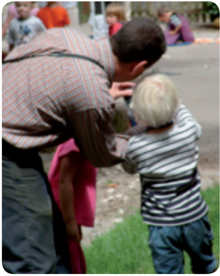
Parent help with photography skills