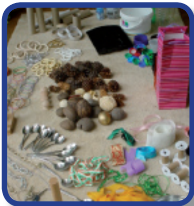
Setting up indoors

We sent letters out to the parents explaining our objectives, together with consent letters for using observations and photographs in the nursery. Lists of objects to collect, and invitations to our first meeting together with other dates for sessions planned. Objects started coming in together with ideas for storing, bags were found and bought. The room for these sessions was chosen; it had to be in a quiet part of the nursery so that the babies were not distracted. Time for these sessions also had to be arranged, following the recommendations in Goldschmied's book, the babies had to be happy, fed and not tired.