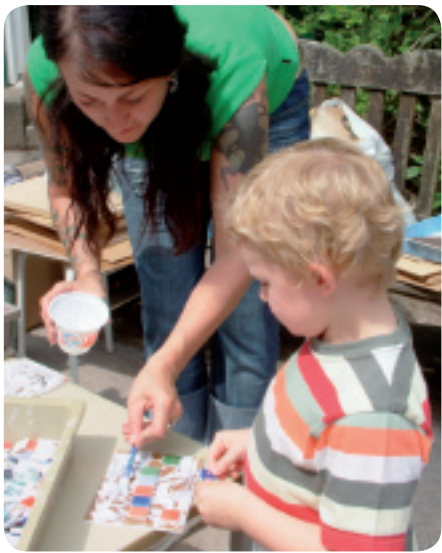
Parent help with ceramic collage work.