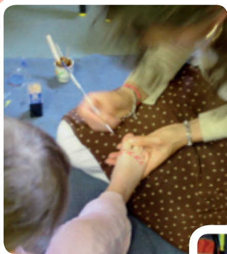
A parent painting henna designs