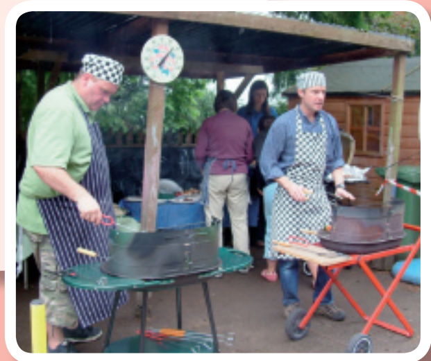
Parents helping with the BBQ!

For several years we have organised a focus week during the summer term when we concentrate all activities and experiences on a theme. We use the skills and knowledge of staff, parents, family members and people from the community to provide as many opportunities as possible. We began many years ago by holding a music week and have continued with arts and crafts week, food week, textiles week and most recently an activity week. We planned the experiences to build across the week and incorporated all the talents we were offered. For example in our food week we focused on different types of food on different days and finished the week with a barbecue in the garden to which parents were invited.