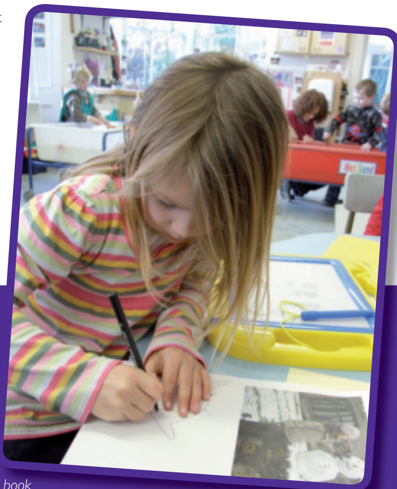
Annotating a photo to go into her special book

This work is continuing to evolve this year as we refine how the learning stories are written and ensure there is a balance of learning stories and other annotated photographs and work collected in the Special Books.